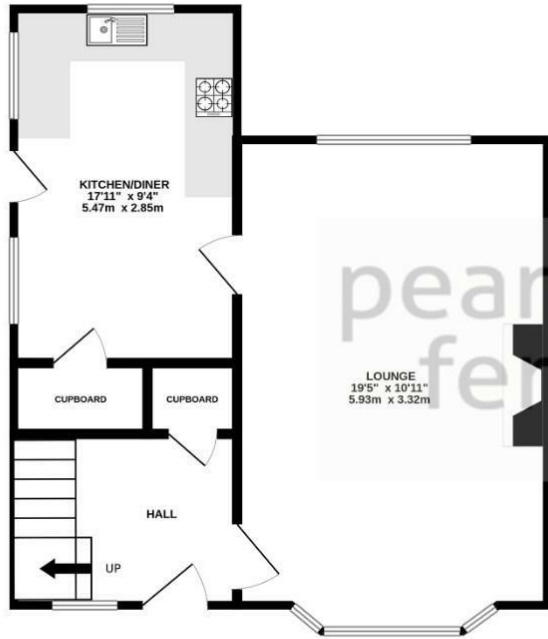
GROUND FLOOR 398 sq.ft. (37.0 sq.m.) approx.